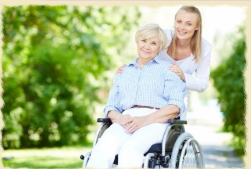
Funding for this program provided by Palm Beach County Division of Community Services. To promote independence and enhance the quality of life in Palm Beach County by providing effective and essential services to residents in need.

You will need to be able to provide the following documents at the time of your appointment: