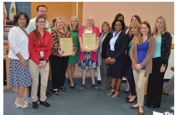
Staff at Palm Beach County Victim Services